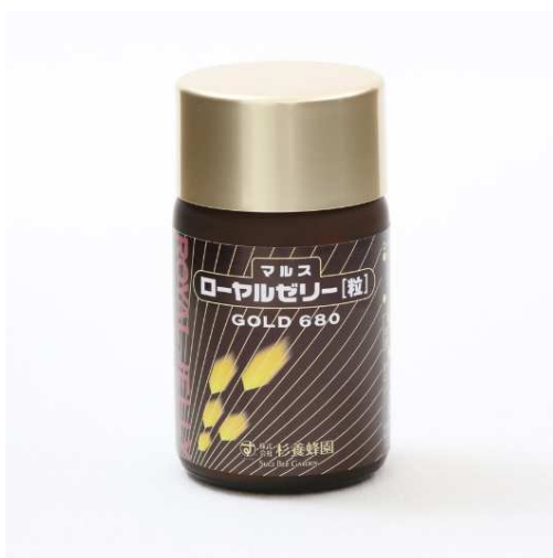
Royal Jelly Gold (Tablets)

We use high quality raw royal jelly that has been vacuum freeze-dried into powder form without compromising its ingredients. A dietary supplement processed into easy-to-swallow sugar-coated tablets.