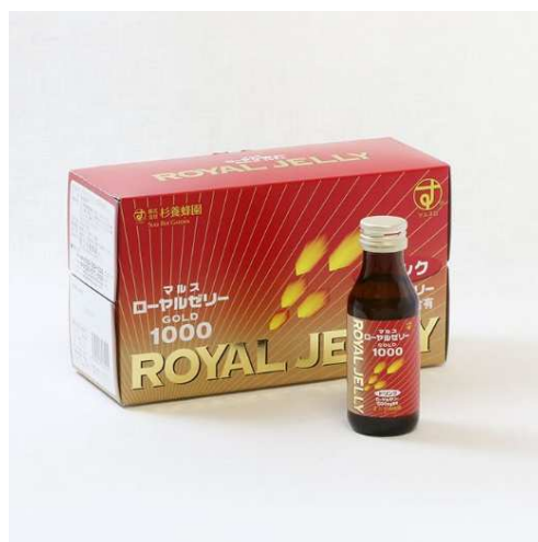
Royal Jelly Drink Gold 1000

We use high quality raw royal jelly that has been vacuum freeze-dried into powder form without compromising its ingredients. A dietary supplement processed into easy-to-swallow sugar-coated tablets.