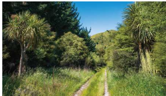
Remote nectar source