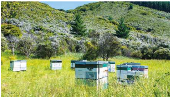
A bee farm in the wilderness with white manuka flowers in full bloom

New Zealand manuka honey is subject to strict quality control standards set by the New Zealand government. Our beekeeping business is highly regarded in New Zealand and we work with local beekeepers to extract honey.