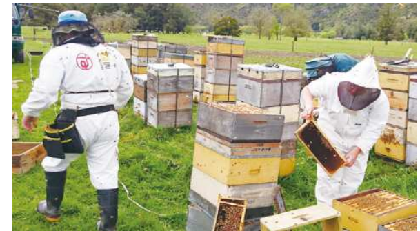
Members of beekeeping department at Sugi Bee Garden collecting honey

You can also watch the video of the rich natural environment where manuka honey is collected!