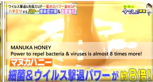
The antibacterial power is almost 8 times more than regular honey!