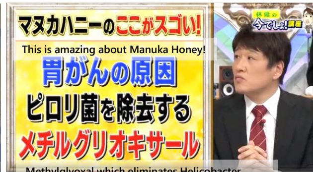
Methylglyoxal which eliminates Helicobacter pylori, the cause of stomach cancer